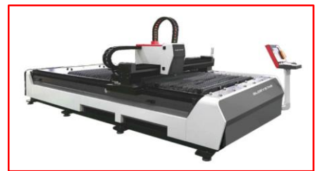
Fibre laser Cutting Machine