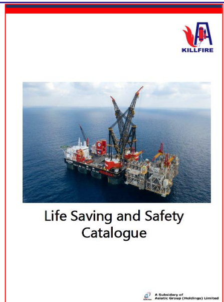
Life Saving and Safety Catalogue

Please look out for it and request from our sales personal and we will be happy to provide you a electronic copy.